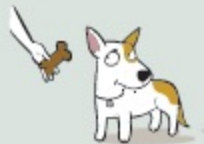
Suddenly Won't Eat but was hungry earlier